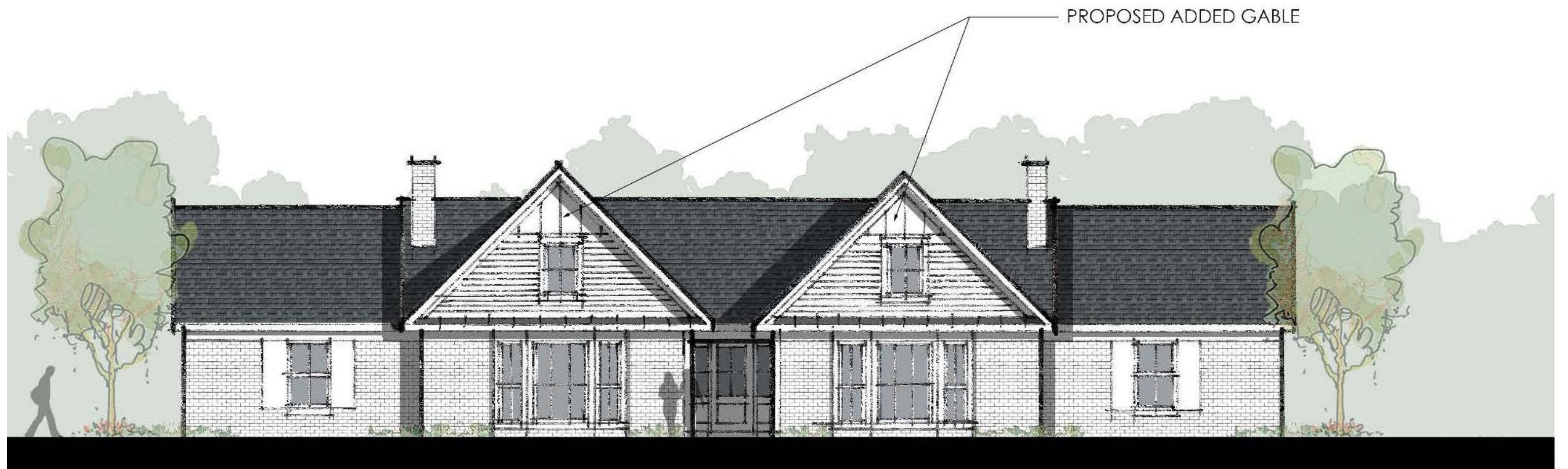
EXISTING HOME CONVERTED TO 3-PLEX