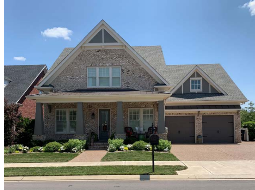
Front-Loaded Product (Lots 1-11)