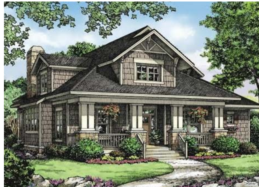
Alley-Loaded Product (Lots 12-20)