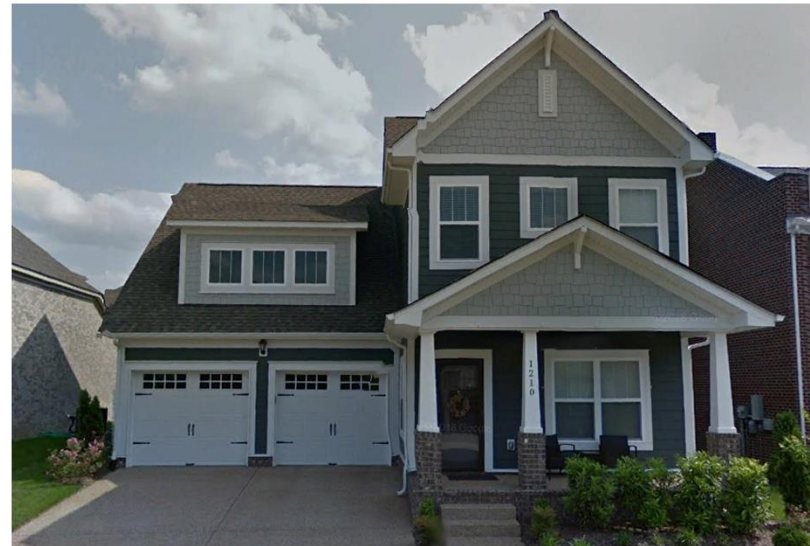
STREETSCAPE OF SINGLE FAMILY HOMES

The proposed homes to be built in Reese Farm are comparable to those previously constructed in Rizer Point. There will be one additional home type, the 45' alley loaded single family, which is being developed by the developer.