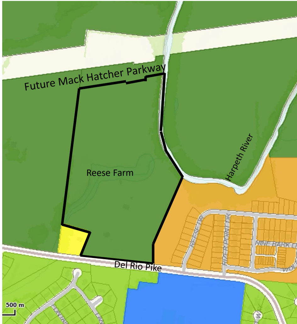
CURRENT ZONING MAP

The Reese Farm is a proposed development located on Del Rio Pike. The property is currently zoned Agriculture.