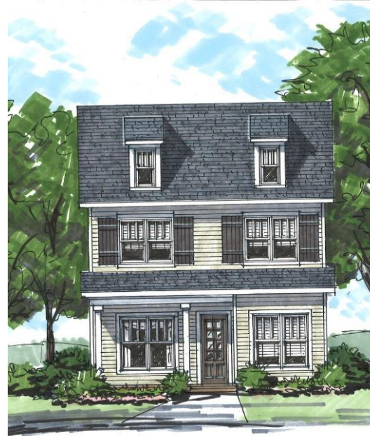
ARCHITECTURAL IMAGE OF 45' WIDE ALLEY LOADED SINGLE FAMILY HOMES