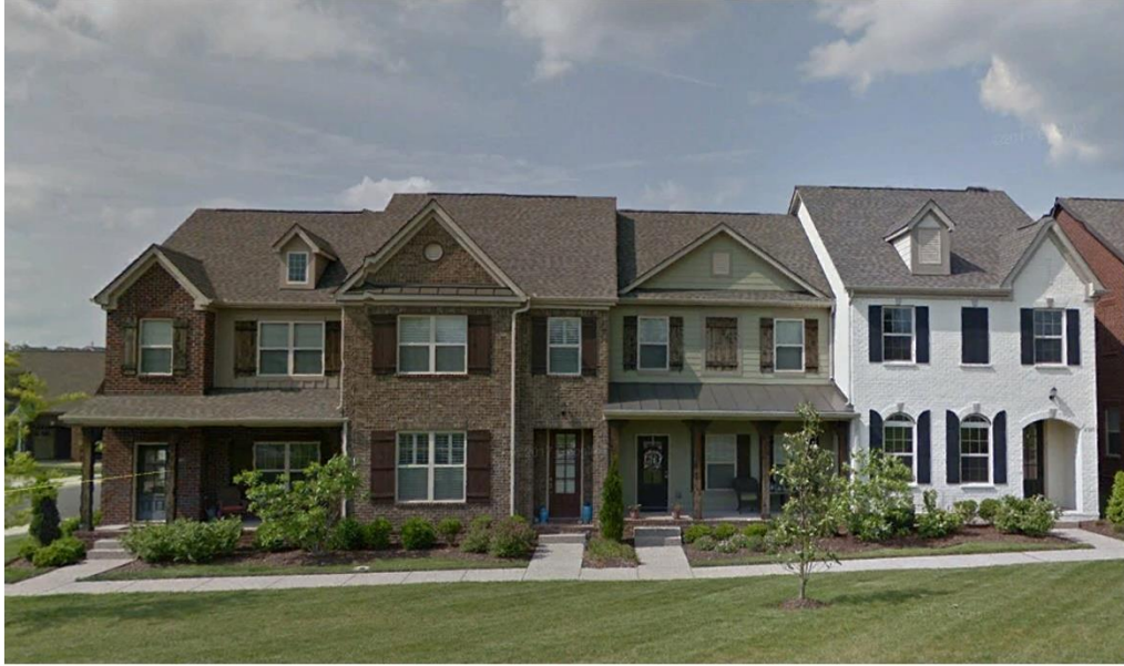
TYPICAL STREETSCAPE OF TOWN HOMES