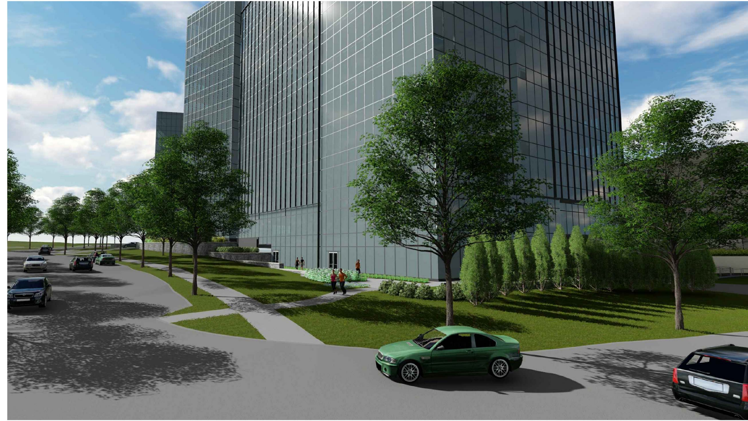
B CHARACTER IMAGERY - FITNESS AREA H-020 SCALE:NTS