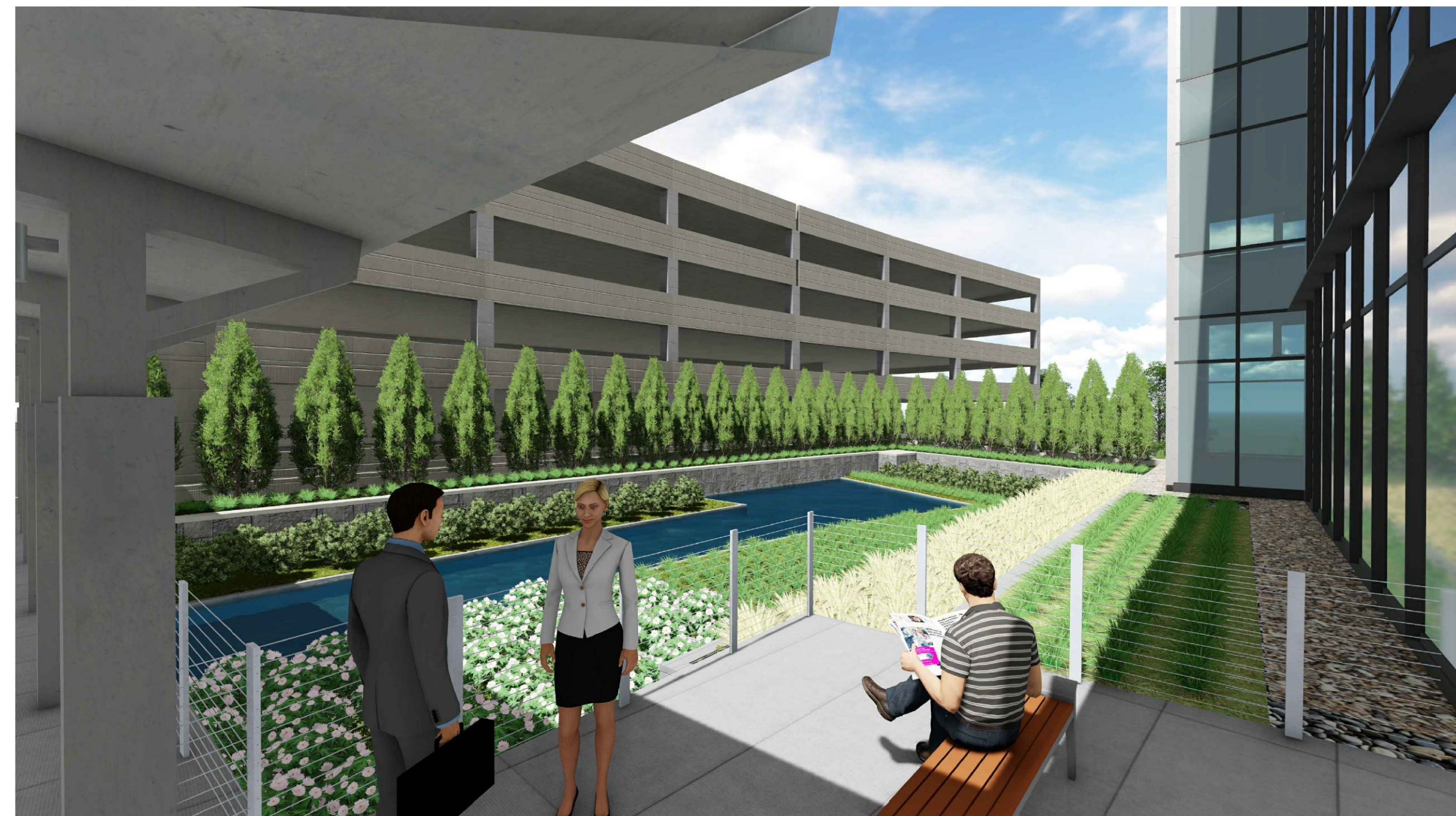
F CHARACTER IMAGERY - POOL (NORTH) H-020 SCALE:NTS