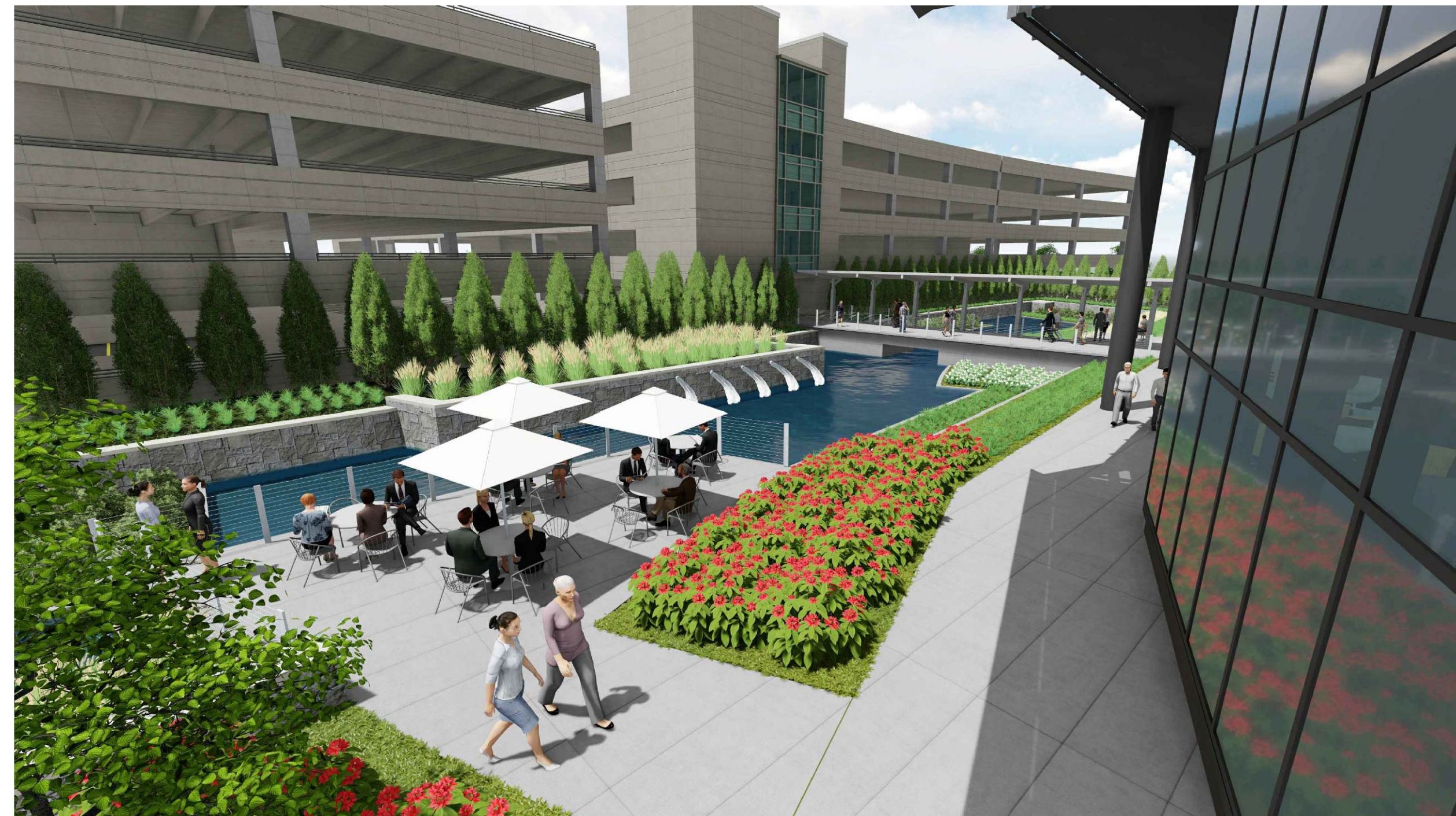
B CHARACTER IMAGERY - BUILDING ENTRY H-020 SCALE:NTS