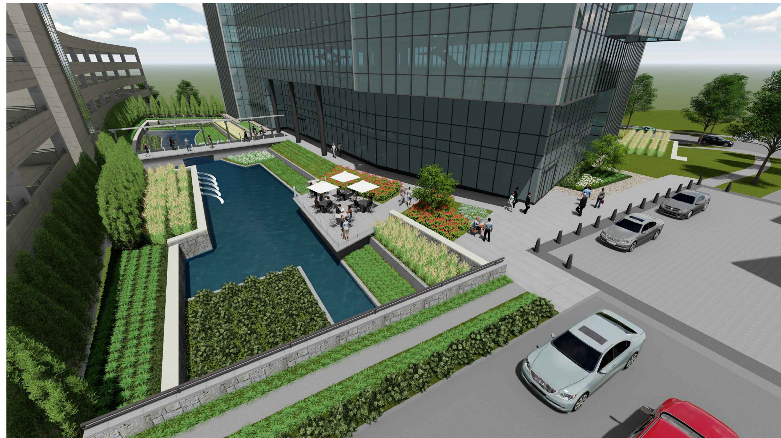
C CHARACTER IMAGERY - BUILDING ENTRY H-020 SCALE:NTS