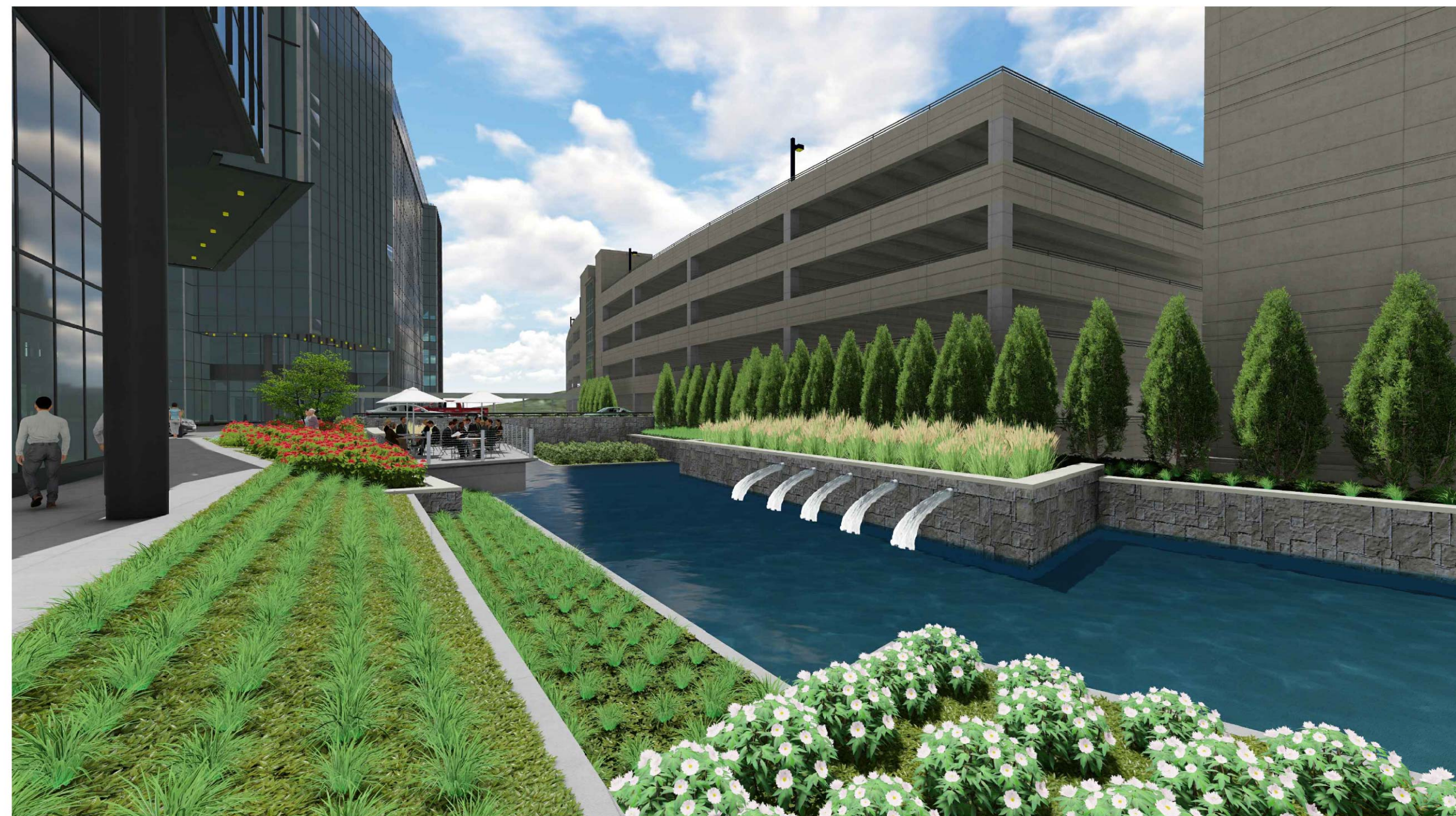
E CHARACTER IMAGERY - POOL (SOUTH) H-020 SCALE:NTS