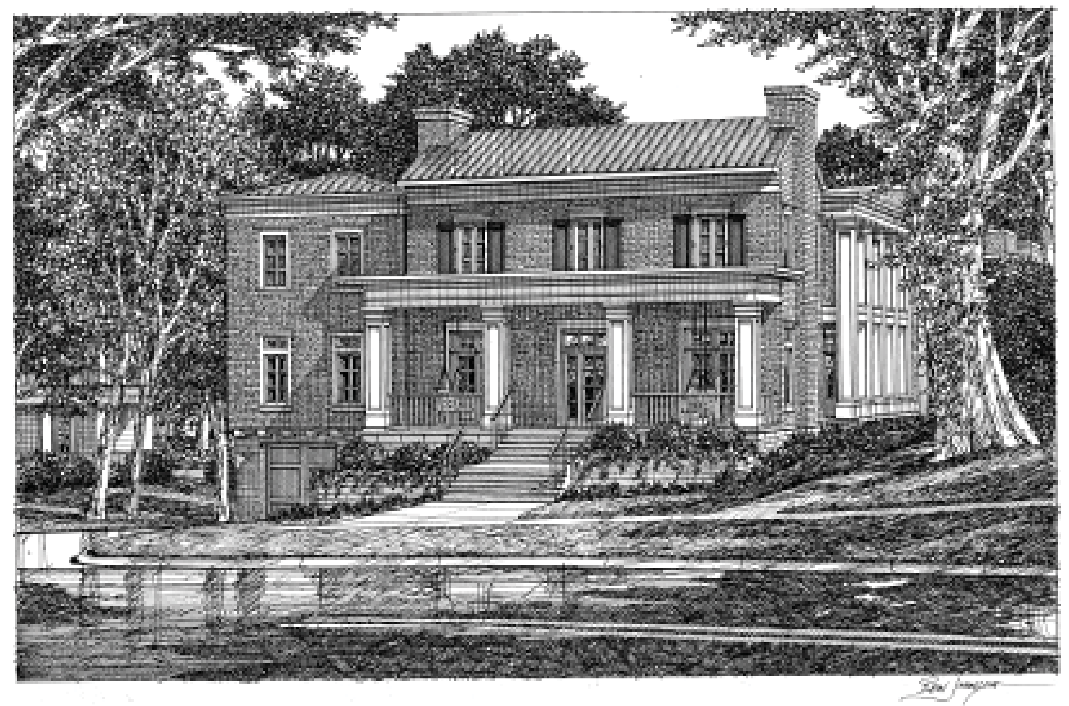
Elevation from West Main Street