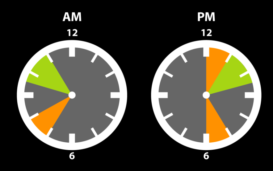
Williamson County Peak Traffic Times Discovery Center Peak Traffic Times