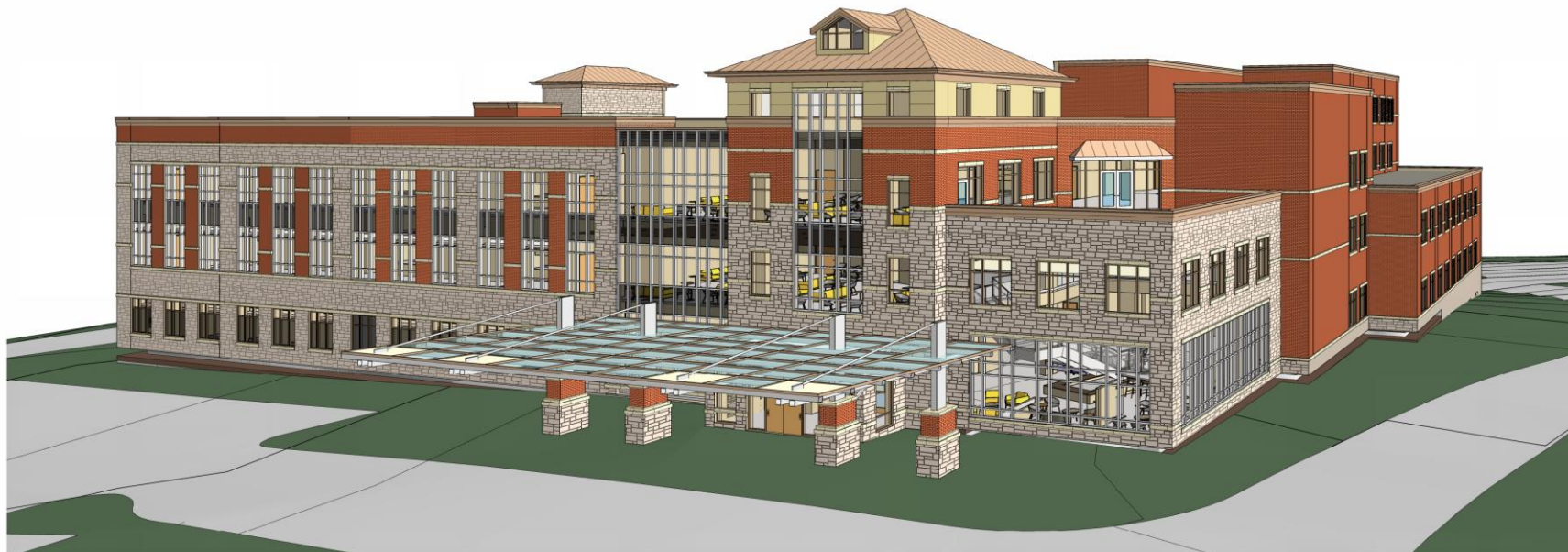
1 FRONT PERSPECTIVE NOT TO SCALE