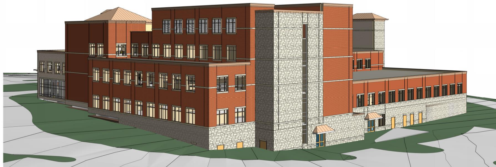
2 NORTHEAST PERSPECTIVE NOT TO SCALE