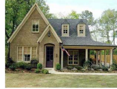
① ARCHITECTURAL STYLE SAMPLES - SINGLE FAMILY HOMES WITH DETACHED REAR GARAGE NTS