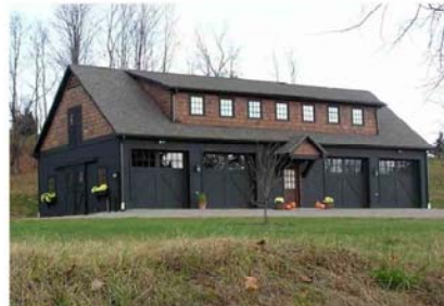
③ ARCHITECTURAL STYLE SAMPLES - CARRIAGE HOUSE GARAGE WITH 2 RESIDENTIAL UNITS ABOVE NTS