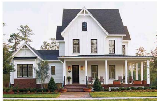
② ARCHITECTURAL STYLE SAMPLES - 4 UNIT BIG HOUSE NTS