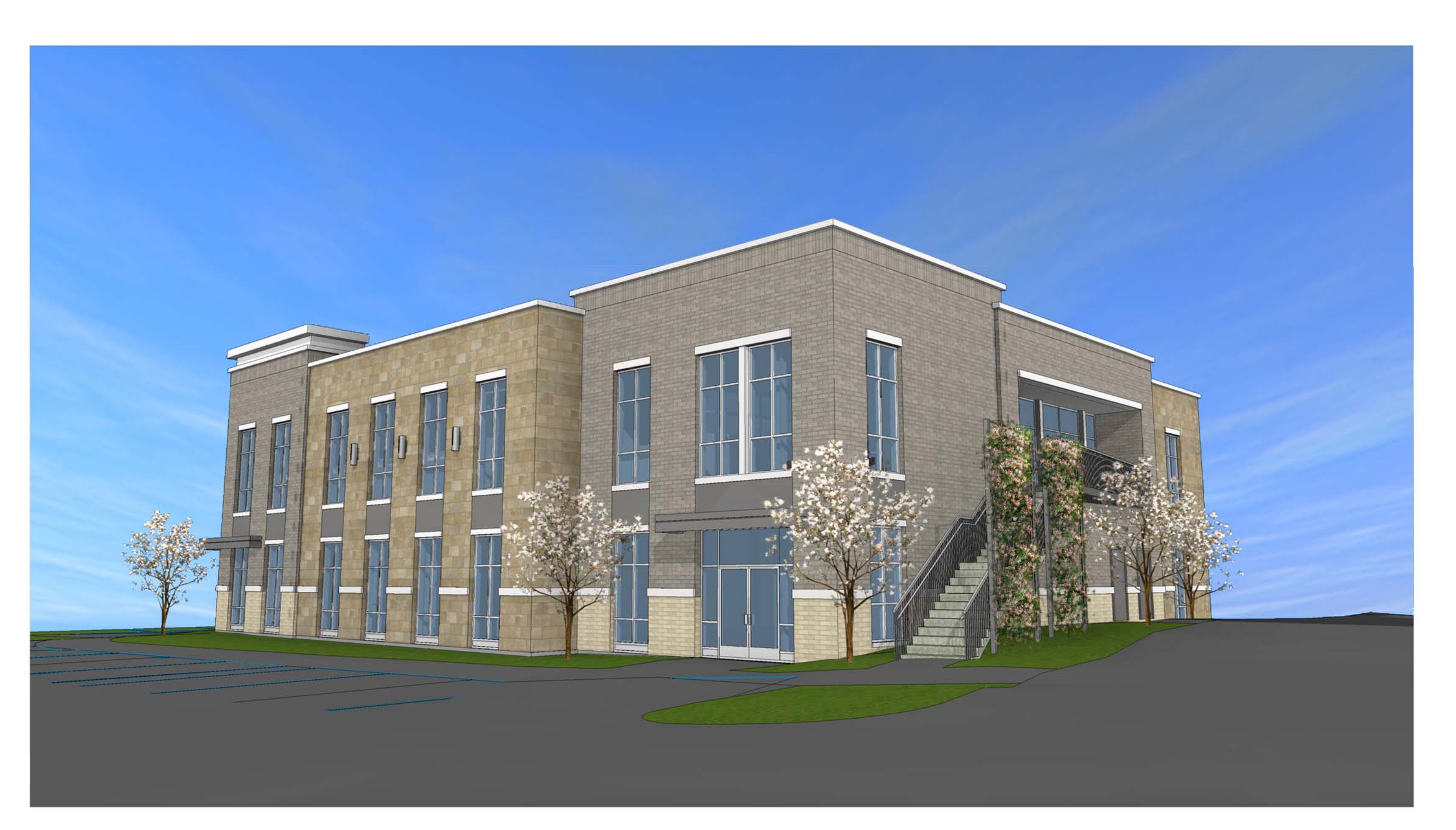
1 View from North-West SCALE: