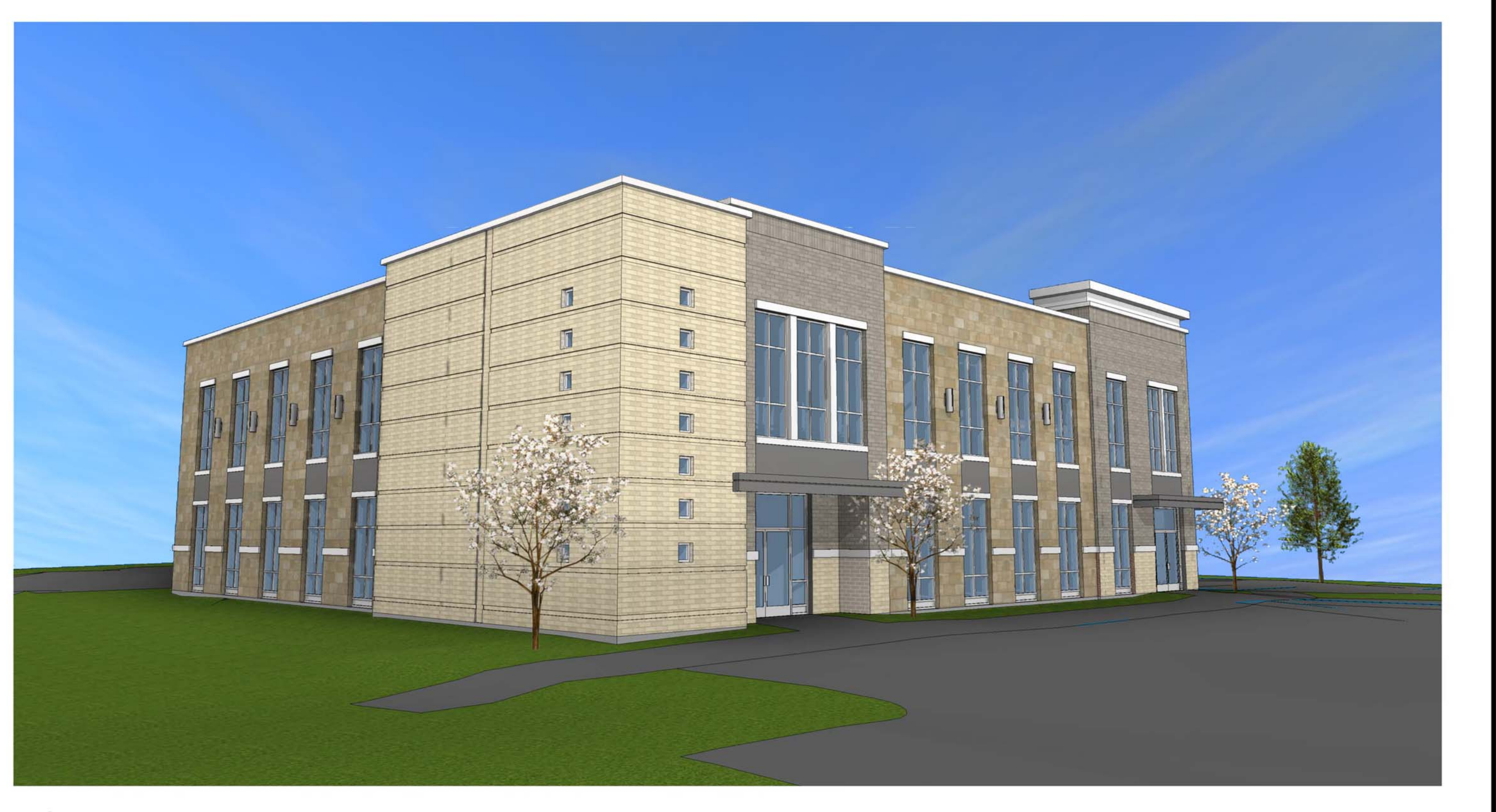
4 View from South-East SCALE:

H M H A H. Michael Hindman Architects, P.C.