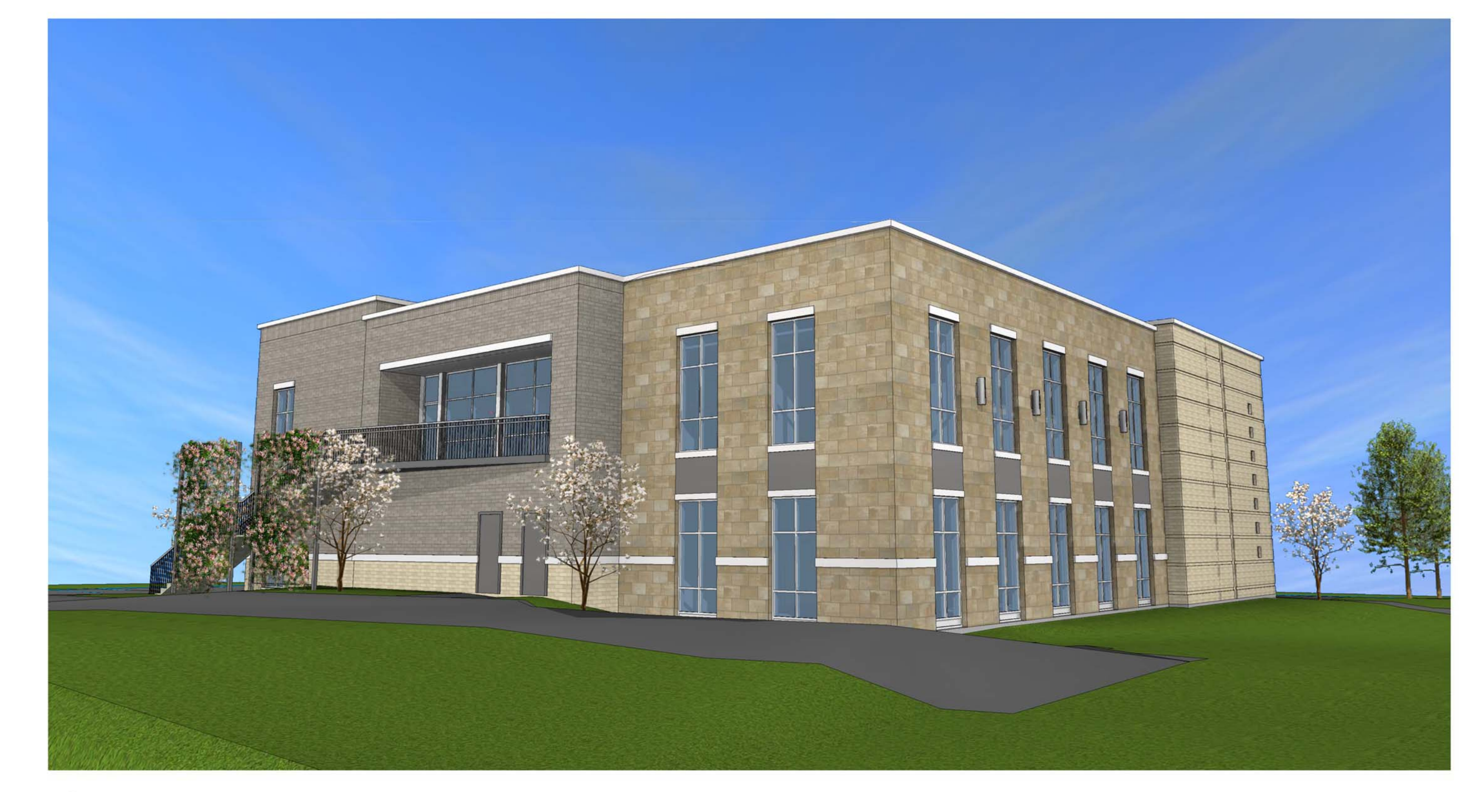
3 View from South-West SCALE: