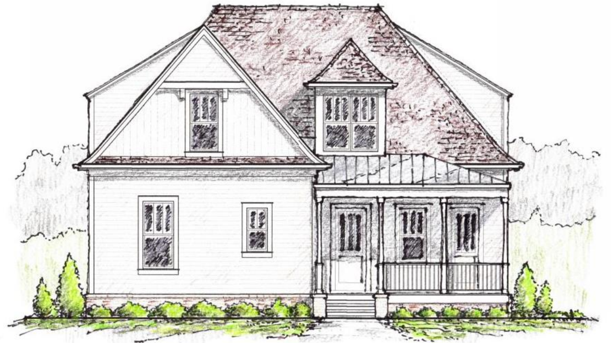
1 - Front Elevation