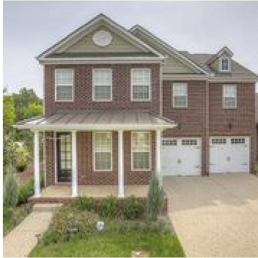
Existing Front Loaded Single Family Homes