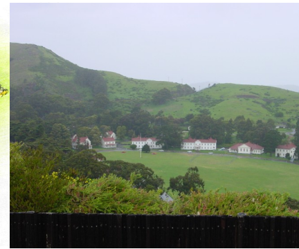
Big House Concept, San Francisco