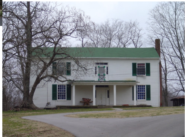
Daniel McMahan House, National Register Property