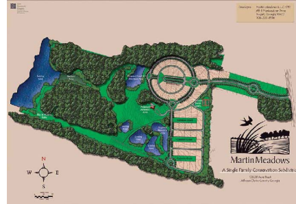
Detached residential conservation subdivision, Athens-Clarke County, GA