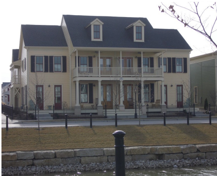
Big House Concept, New Town of St. Charles, IL