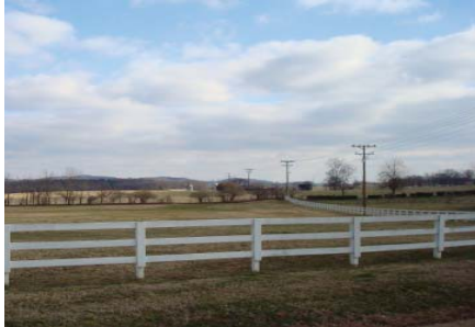
Rural viewshed along Franklin Road