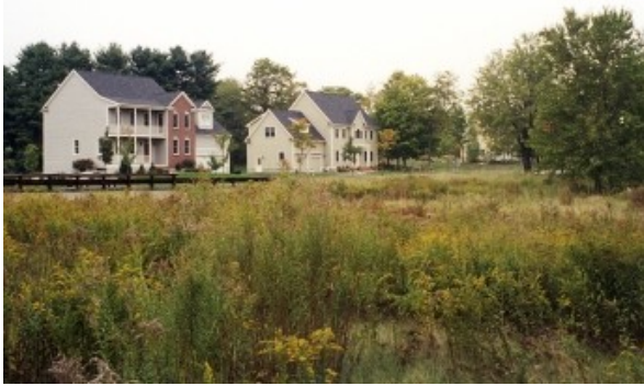
Detached Residential Conservation Subdivision Assabet, MA

The following principles will guide City decision-making within the Franklin Road and Mack Hatcher Parkway area: