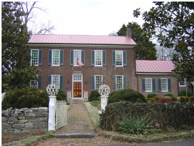
Wyatt Hall, National Register Property