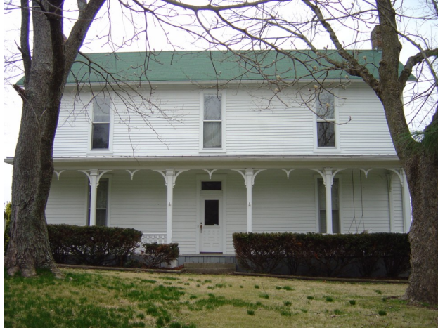
Guider House, National Register Eligible Property