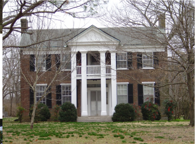
Thomas Shute House, "Creeside", National Register Property