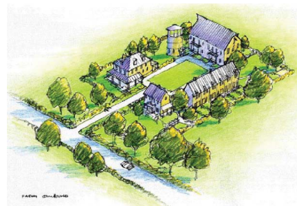
Farmland Compound concept