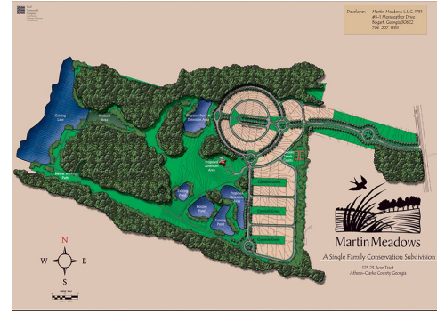
Detached Residential Conservation Subdivision, Athens-Clarke County, GA