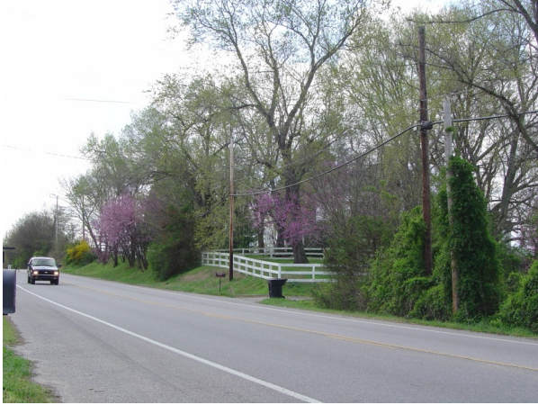
Franklin Road Corridor