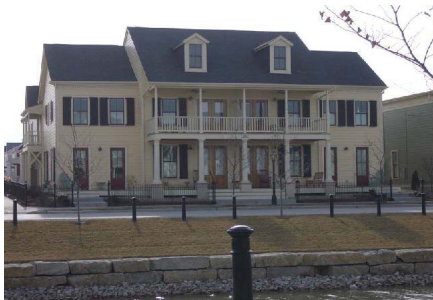
Big House concept, New Town of St. Charles, IL