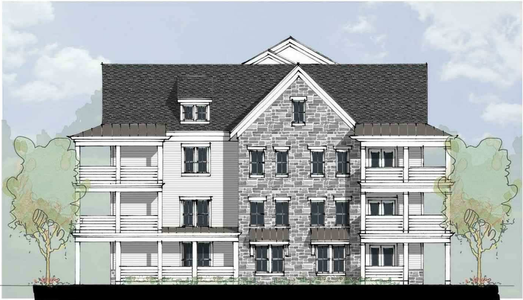
ARCHITECTURAL ELEVATION TYPE 'E' BUILDING FACADE FACING FRANKLIN ROAD