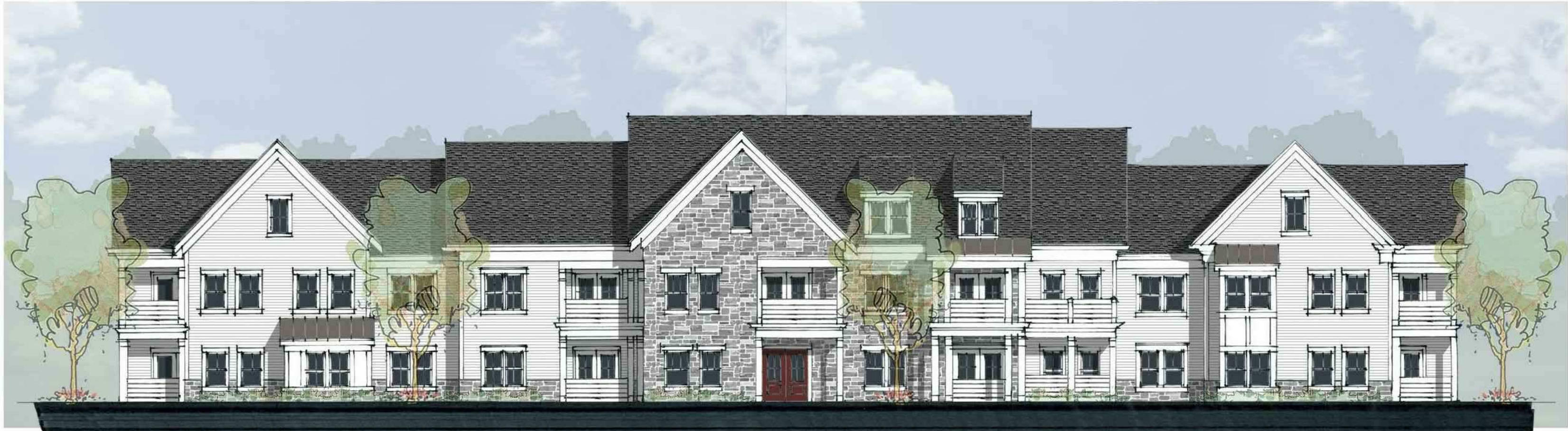
ARCHITECTURAL ELEVATION TYPE 'A' BUILDING FACADE