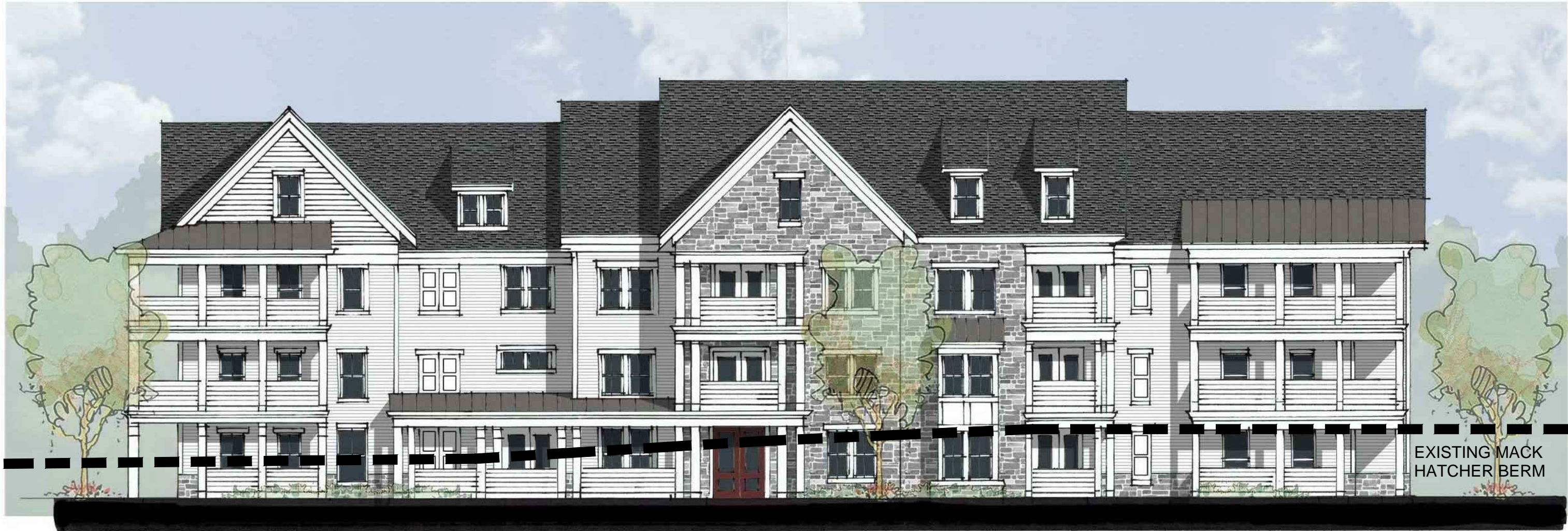
ARCHITECTURAL ELEVATION TYPE 'E' BUILDING FACADE FACING MACK HATCHER PARKWAY