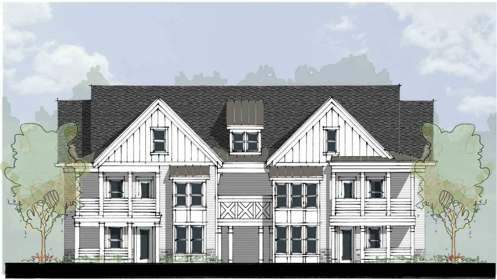
ARCHITECTURAL ELEVATIONS TYPE 'C' & 'D' BUILDING FRONTAGES