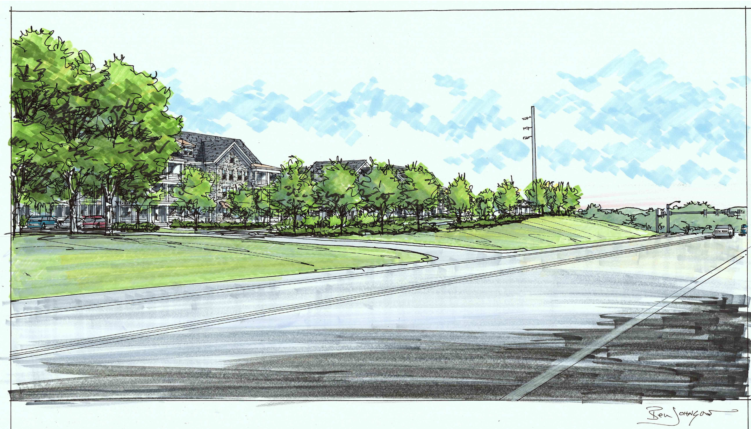
ARCHITECTURAL ELEVATION VIEW FROM FRANKLIN ROAD TO WESTERN DEVELOPMENT EDGE