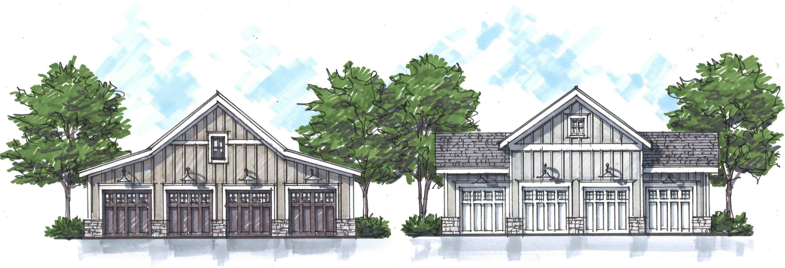
ARCHITECTURAL ELEVATION VIEW OF TYPICAL GARAGES