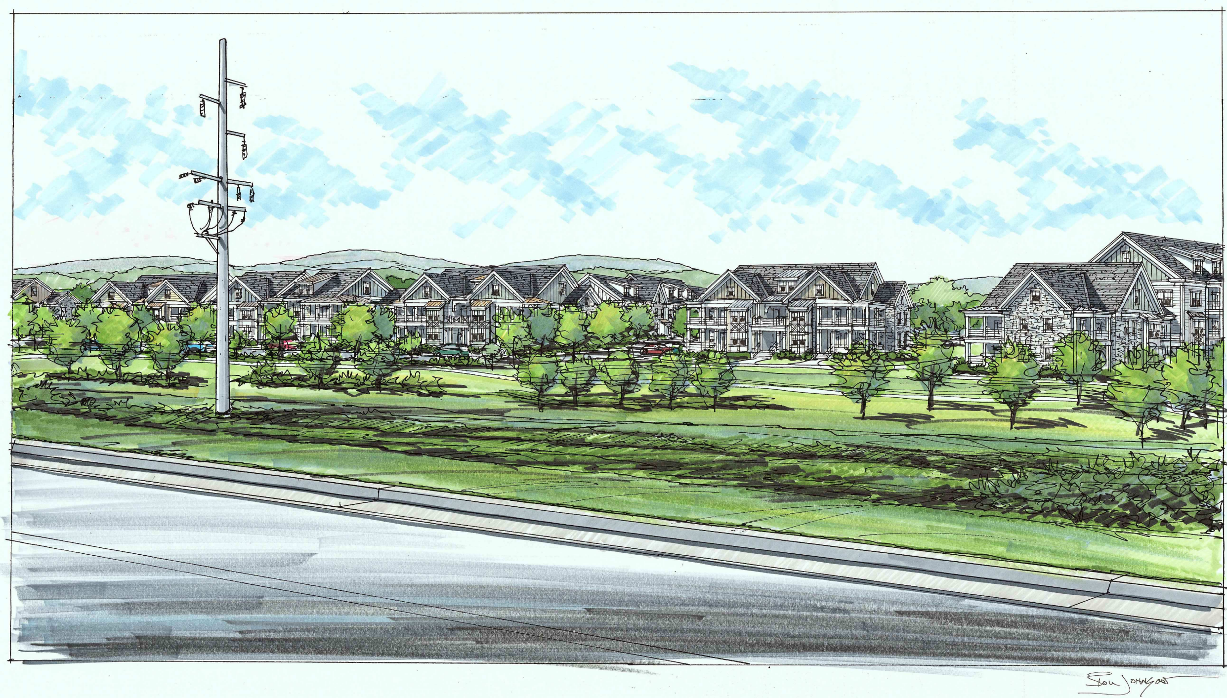
ARCHITECTURAL ELEVATION VIEW FROM MACK HATCHER BYPASS TO COMPLEX DRIVING WEST