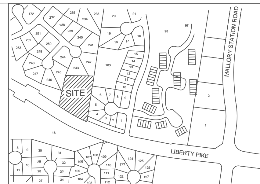
Vicinity Map NOT TO SCALE MAP AND PARCEL 62 N - 25

Certificate of Survey I hereby certify that the subdivision plat as shown hereon is correct and that all of the monuments shown hereon have been placed as indicated. This subdivision plat correctly represents a survey made under my supervision on the 3 day of MARCH , 2015.