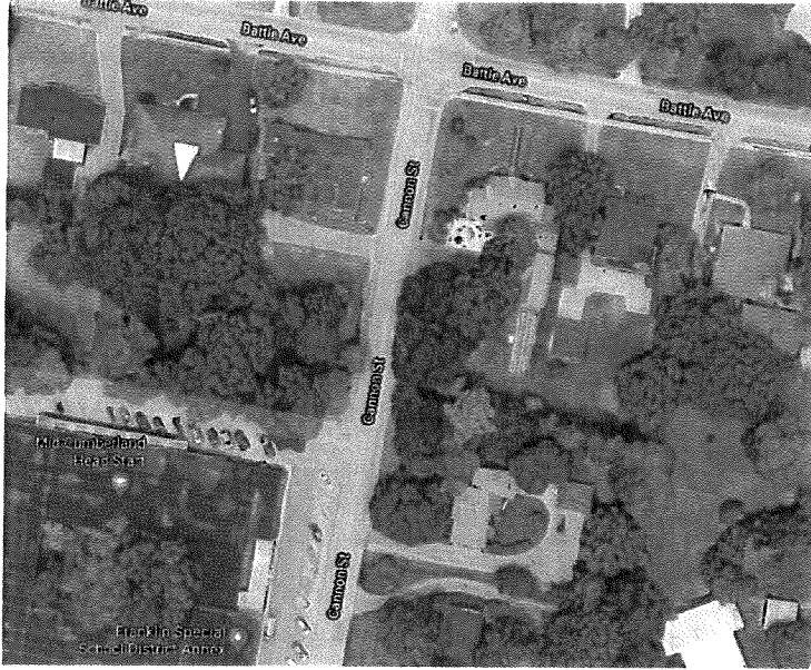
Figure 1 Aerial Photo of Sinkhole Location