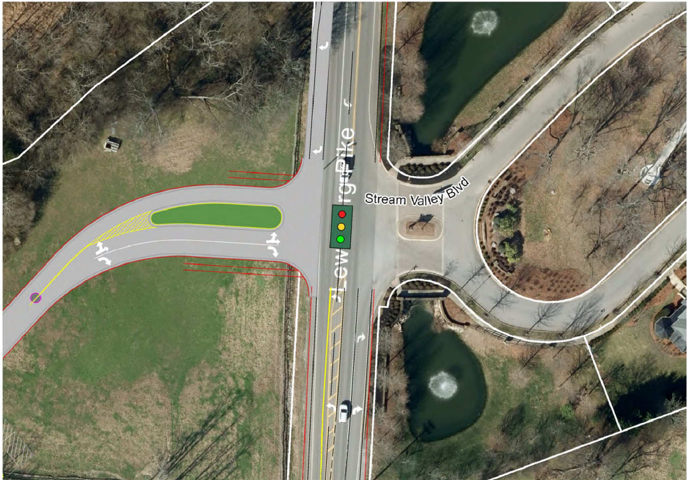
NEW TRAFFIC SIGNAL AT LEWISBURG PIKE AND STREAM VALLEY BLVD