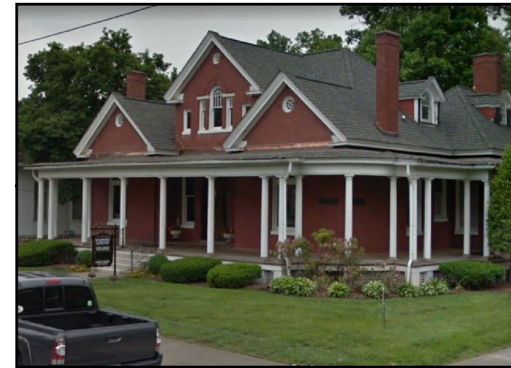
Church/S. Margin Street

This zoning district is intended as a transition from more intensive commercial uses (Central Commercial, Neighborhood Commercial, etc.)