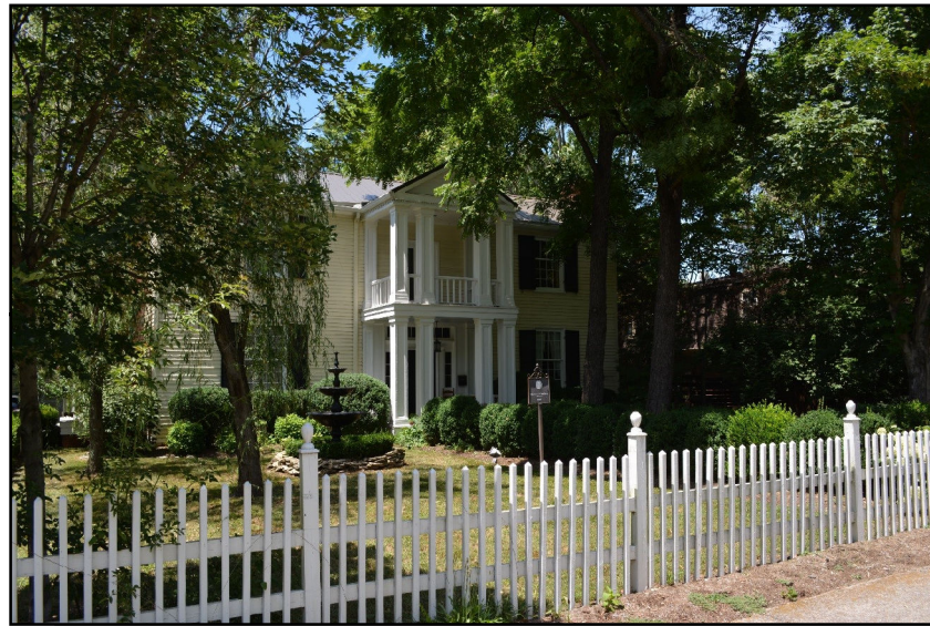
1102 West Main St

Four distinct neighborhoods in the City of Franklin are in the Office Residential Zoning district.