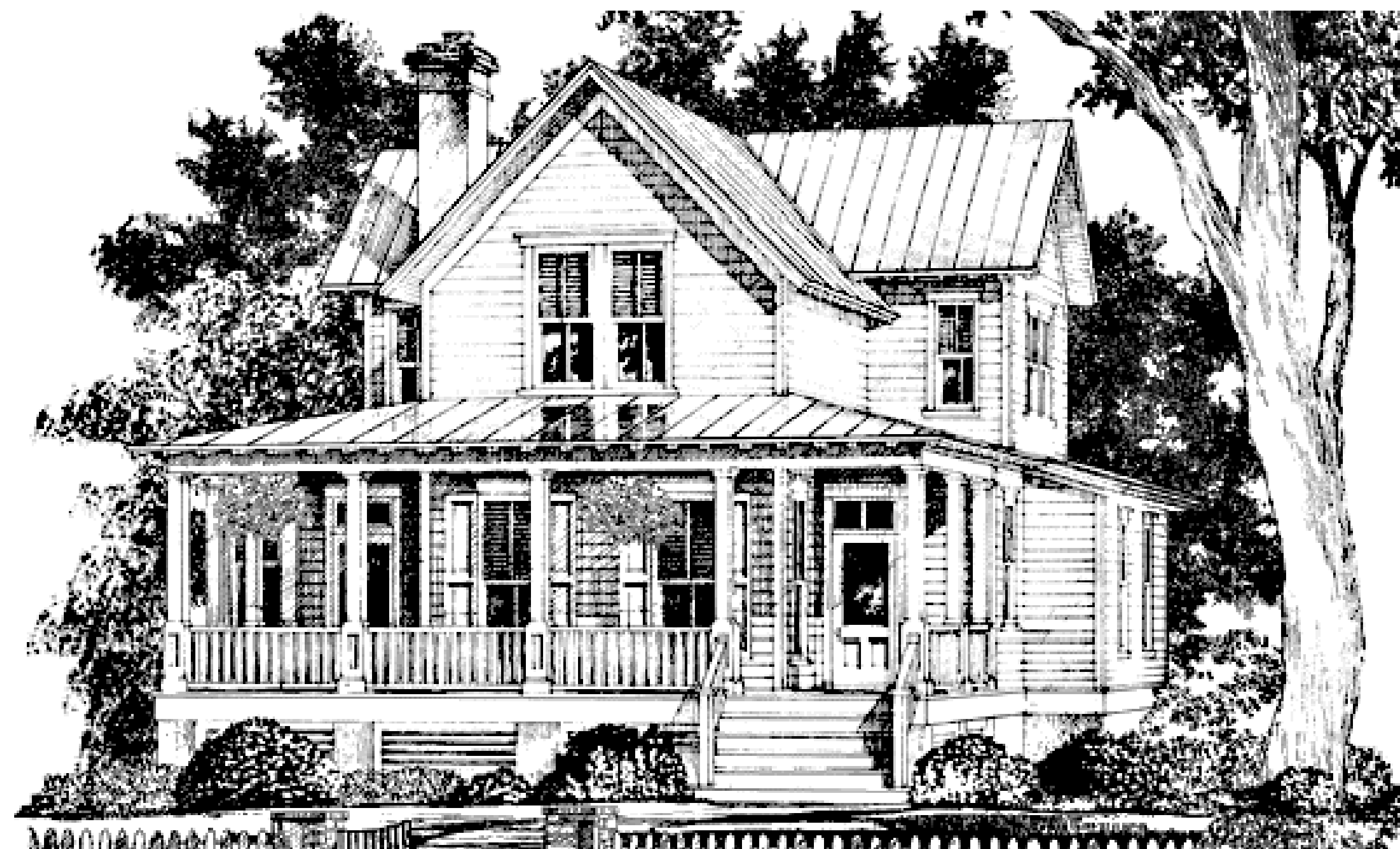
STANDARD HOME FRONT ELEVATIONS CONCEPTUAL ONLY / NOT FOR APPROVAL

ELEVATIONS PROVIDED BY: ZACH MCKINNEY AT CAPSTONE HOMES, LLC